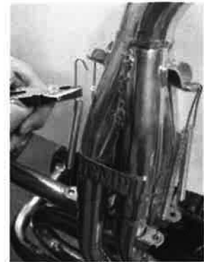
Vertical Collector Pictured